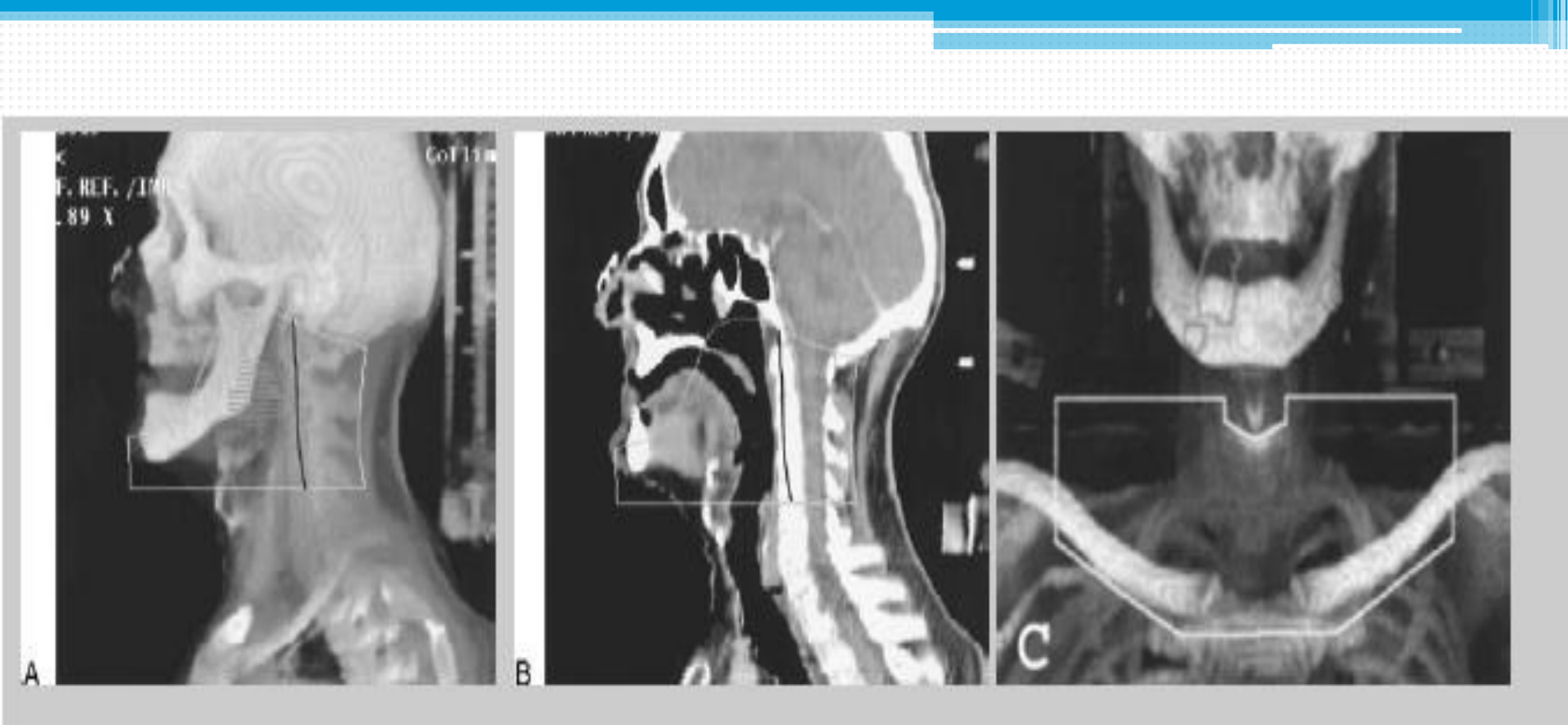
Fig. 24-2: A: A digital composite radiography shows a left lateral portal encompassing a T2N2cM0 squamous cell carcinoma of right tonsil metastasized to level IB node on the right and level II node on the left neck. B: A sagittal view shows structures included in the irradiated field. The portals are reduced after 40 to 45 Gy to exclude spinal cord ( dark line ). Tumor boost portal can be designed based on the outlined gross tumor volume. C: Anterior lower neck portal.