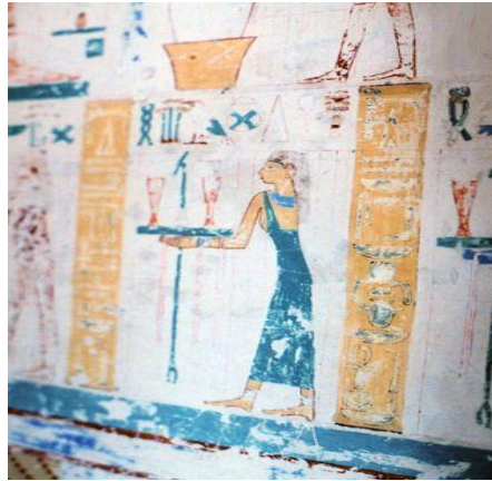
Mir tourist area