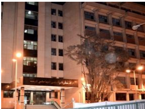
Raghe hospital (for liver diseases)