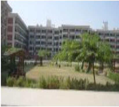
Female students residency