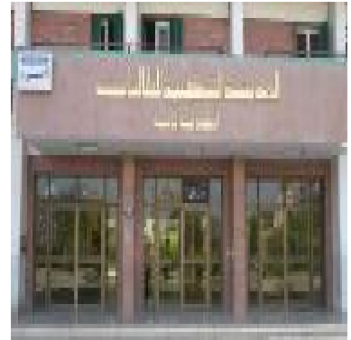
Female students residency