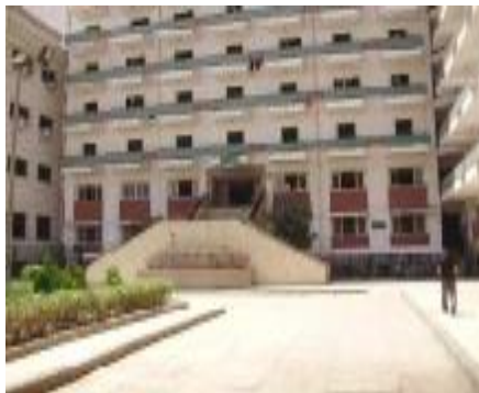
Male students residency