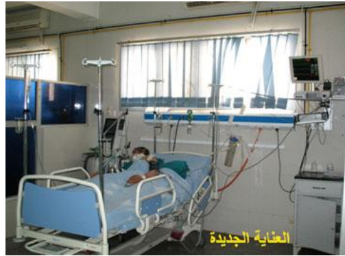
Intensive care Unit