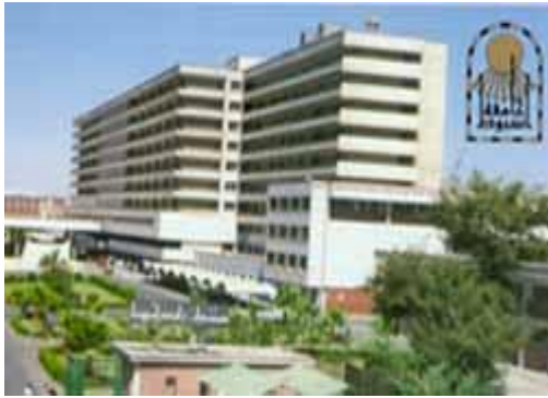
Main Hospital Building