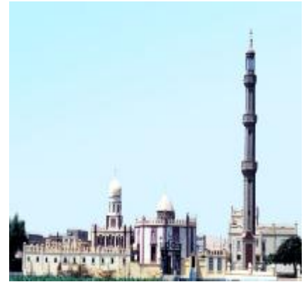
Mujahideen archaeological Mosque