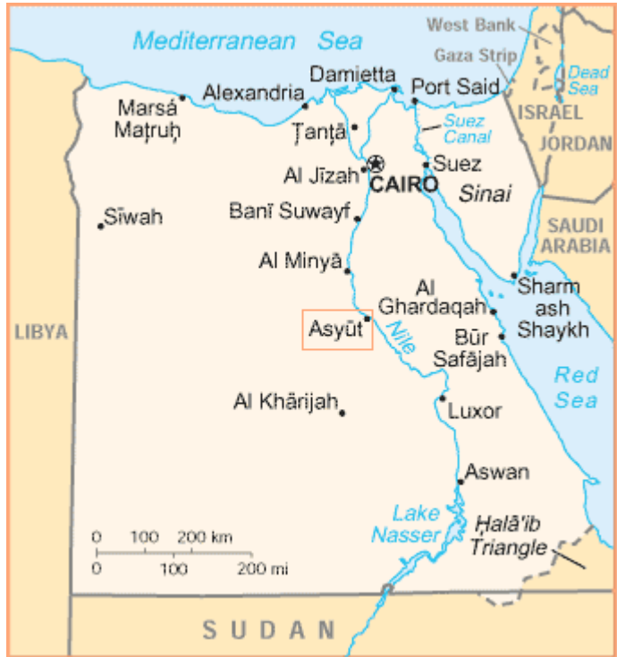
Map (1): Location of Assiut Governorate

The most advantage in Assiut that it is a quiet city with a friendly people who are used to dealing with foreigners. Assiut has a fair climate especially in winter (study semester) where warmness are one of the most advantages, besides you are about 250 km from Luxor the capital of ancient Egypt where you can spend your weekend if you don't like the sea (Hurgada).