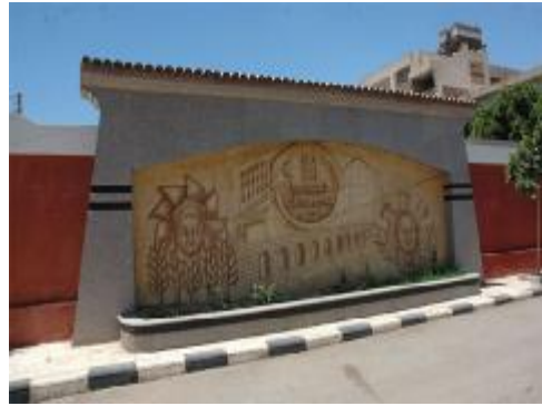
Om El Kosour Hospital