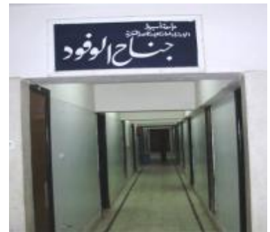
Foreign students' residency