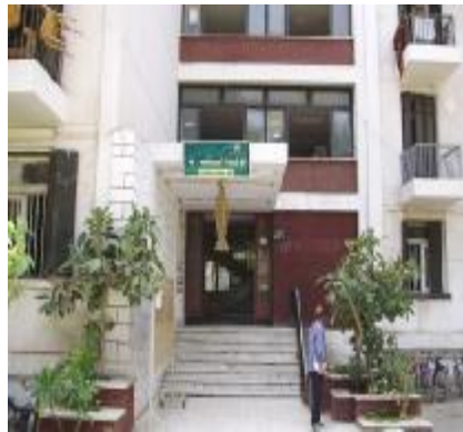
Male students residency