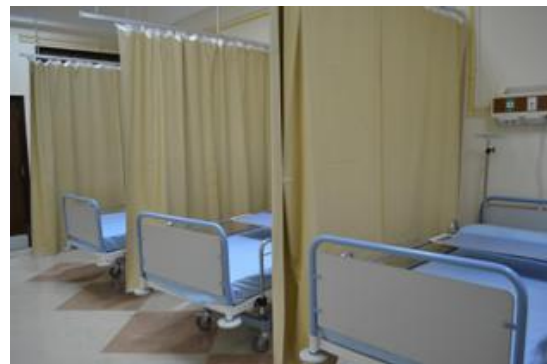
Intensive care unit