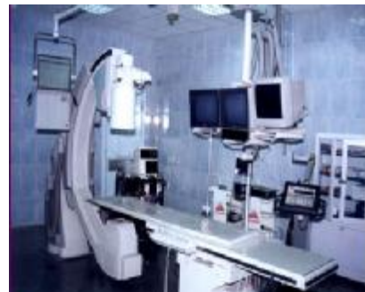
Heart catheter unit