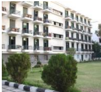
Male students residency