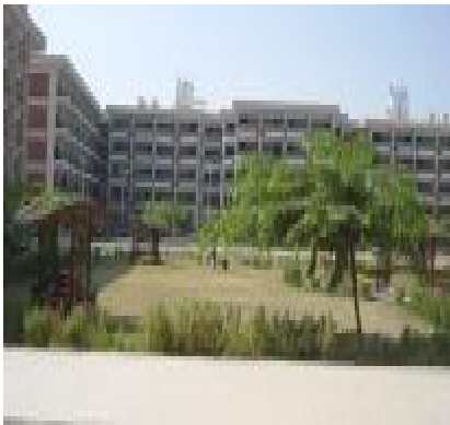
Female students residency