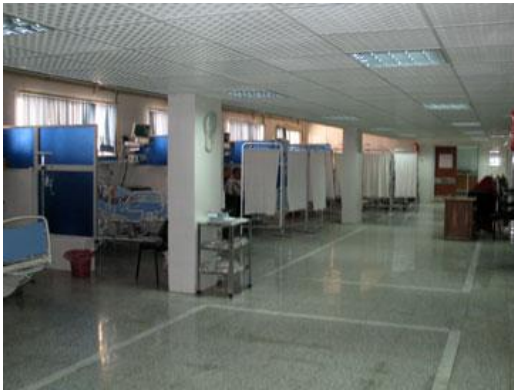
Intensive care unit