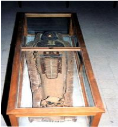
Salam school museum