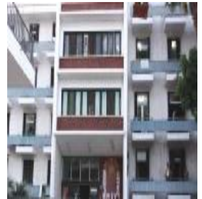
Male students residency