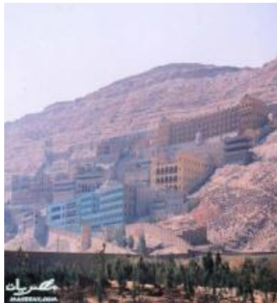
Virgin Mary convent