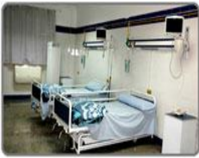
Intensive care unit