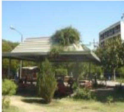
Female students residency