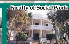
Faculty of Social Work