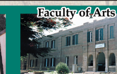
Faculty of Arts