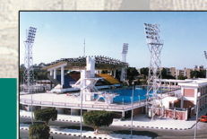
Olympic Swimming Compoud