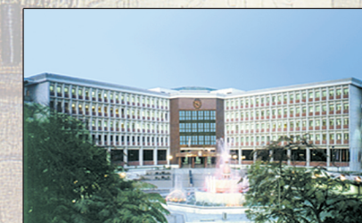
University Administration Building

Assiut University was established in 1957 as the first university in Upper Egypt. The university Logo is made up of an armour in the centre of which is the Sun disc (slogan of Akhenaton to symbolize Ancient Egypt) shedding light on the name of the university written in normal Kufi letters (to symbolize the Arab era). From the Sun come out the sun-rays in shape of hands stretching out with goodness, while the letters forming the name of the university tower up towards the light of the Sun.