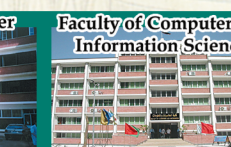
Faculty of Computer and Information Sciences